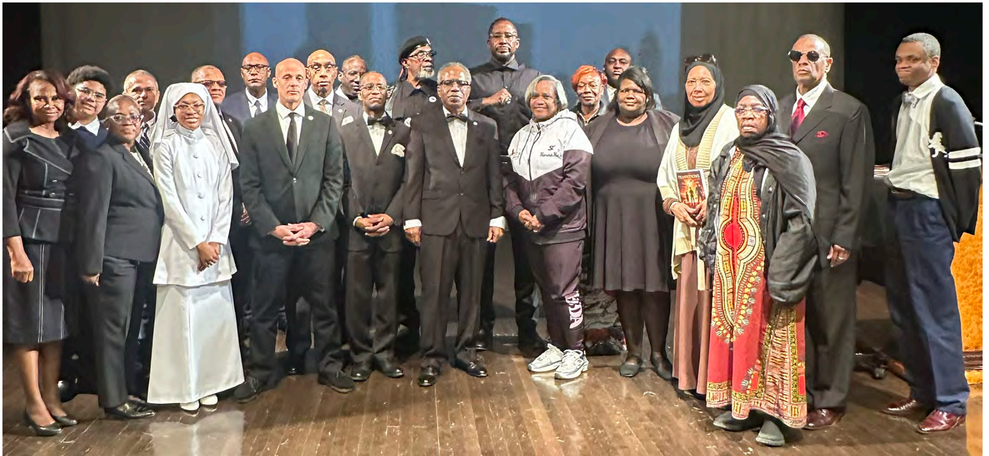
International attendees of the Commemoration of Black Holocaust Remembrance Day 2026 held Saturday April 11th at Joe's Emporium 3309 Bunker Hill Rd. Mt. Rainer, Maryland