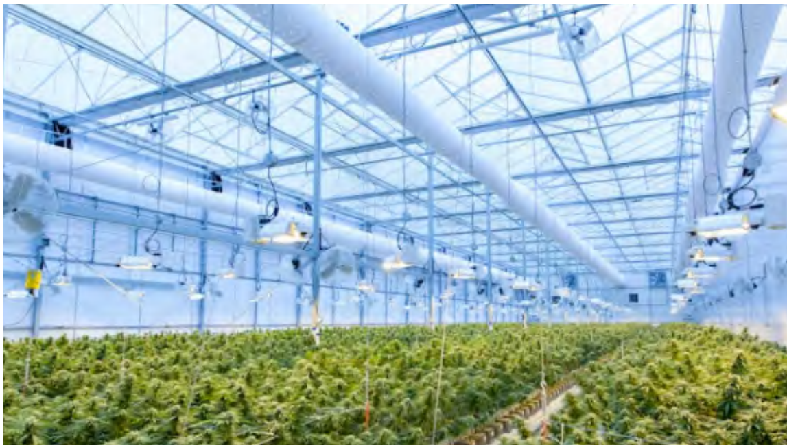
Marijuana growing plant

Chicago's Cannabis Laws: What Residents and Visitors Need to Know in 2026